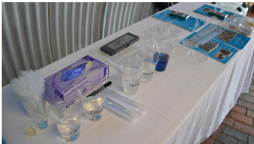
Example of set up of vaccine activity